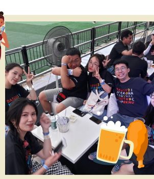
Chicken & Beer Festival