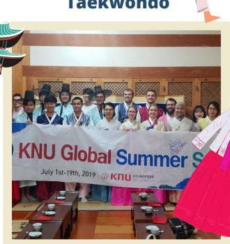
Traditional Hanbok Clothing